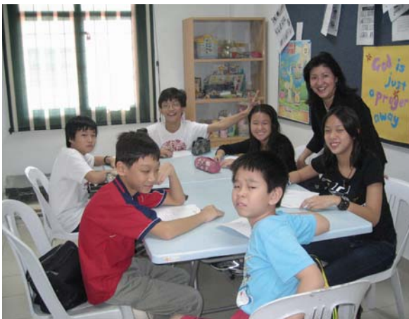
Discovery Hour – Children

Rev. Rick Warren in his book "The Purpose Driven Life," describes God's purposes for his church being similar to an individual. "Worship helps you focus on God; fellowship helps to face life's problems, discipleship helps to fortify your faith; ministry helps find your talents; evangelism helps fulfill your mission."