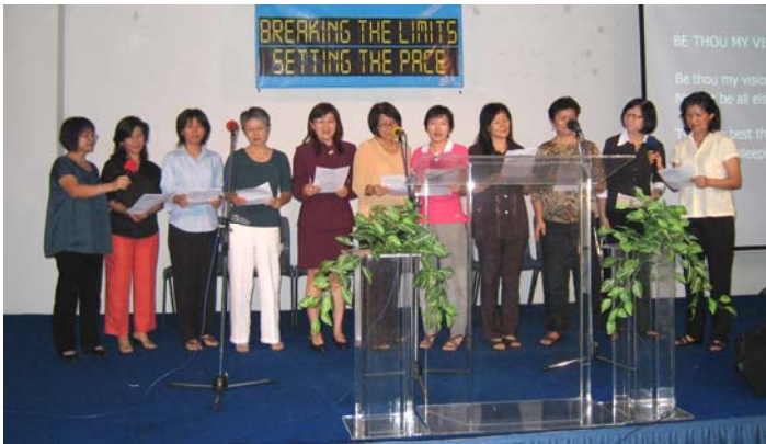
Song presentation by the ladies of Women Aglow

Good Friday and Easter came next on 21 st and 23 rd March respectively. GAYA (Youth Department) put up a stirring performance entitled “The Eleventh Hour” on Good Friday and our choir sang 2 songs accapella style on Easter morning.