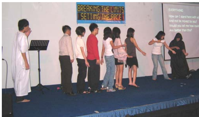
Special presentation entitled, “The Eleventh Hour” by the youths of GAYA on Good Friday