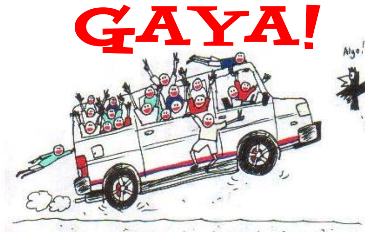
GAYA (GA Youth Aflame) – Youths