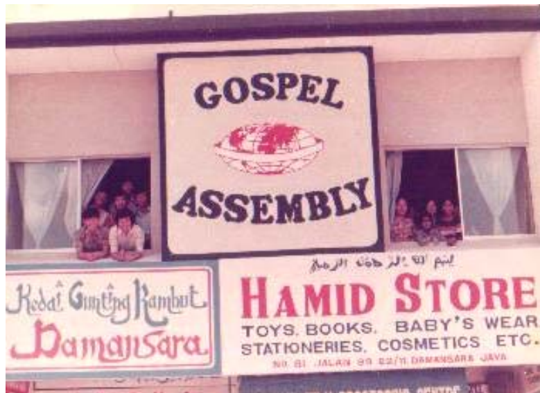
Gospel Assembly was located at the upper floor of a rented shop lot in Damansara Jaya.

GA moved to her own double-storey shop lot in DU and currently her own semi-D factory lots. The Church building has expanded, and having spent 29 years in GA, I attribute the ministry of this Church in playing a part to mould my life to what and where I am today and for this, I am very grateful to God, my pastors, leaders, and brothers- and sisters-in-Christ, some of whom have become my close friends. I do not live a very extra-ordinary life. Even with short-comings and handicaps, God has been good and faithful all these years and He has kept to His promise in John 10:10 "I have come to give life and to give it abundantly." The life and pulse of the church is the people and not the building (Matt 18:17) and this is where I learned about God through His Word (Psalm 19:7-11) and live out my Christian life.