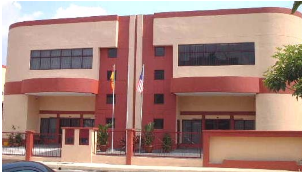
Our current premise in Sunway Damansara

growing church is to fulfill this mission. Spiritual and numerical growth is a work of the Spirit. If a church will fast and pray, be disciplined in the Word of God and reach out to people, numerical and spiritual growth will happen. "Except the Lord build the house, they labour in vain." When we do our part, God will do His. So Church, arise and be ready when the harvest comes!