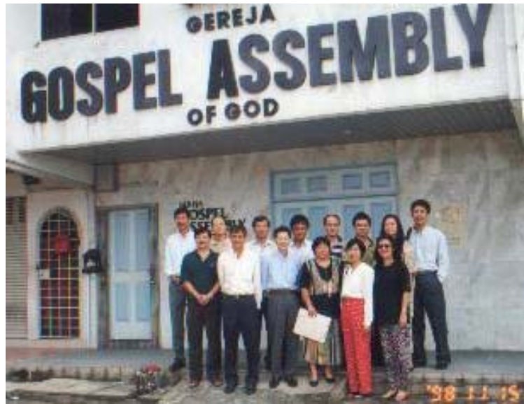
The Building Committee in front of the then Gospel Assembly of God premise in Damansara Utama

GA was the place where I first learnt to engage with God through the Prayer Meeting, His Word, and Worship. As a young believer there were occasions where I found my viewpoint and values conflicting with the Word of God. I understand that this is inevitable as from young we were raised and taught from a secular perspective. SCG classes, home cell, opportunities to serve in the church to disciple us together with reading Christian literature helped me understand more about the Kingdom of God and the life God intended for me. It may not be easy as we are in the world but not of the world. Changing our mindset and values to align with God’s word is a lifelong process so we need to be continuously disciplined. The key lies with us and not the Church or what kind of a church I am in. We must desire to know more about kingdom values and principles to live out the abundant life in practical ways.