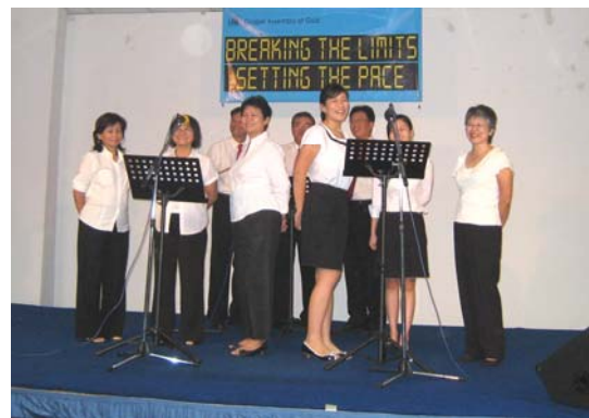
The Church Choir on Easter morning