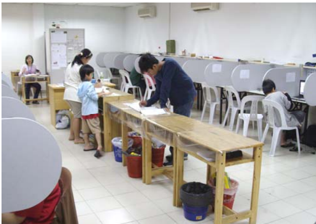
GA Resource Center – Home School