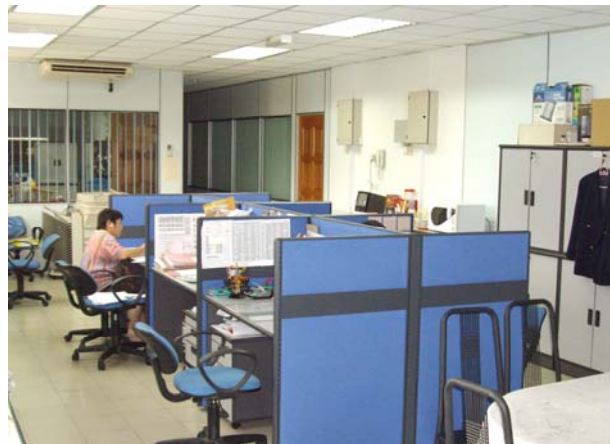
The Church Office