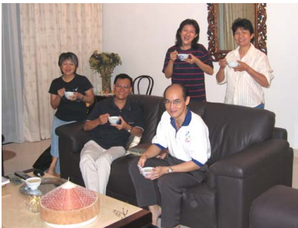
Home Cell Ministry