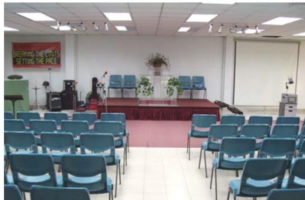
The 2nd Sanctuary