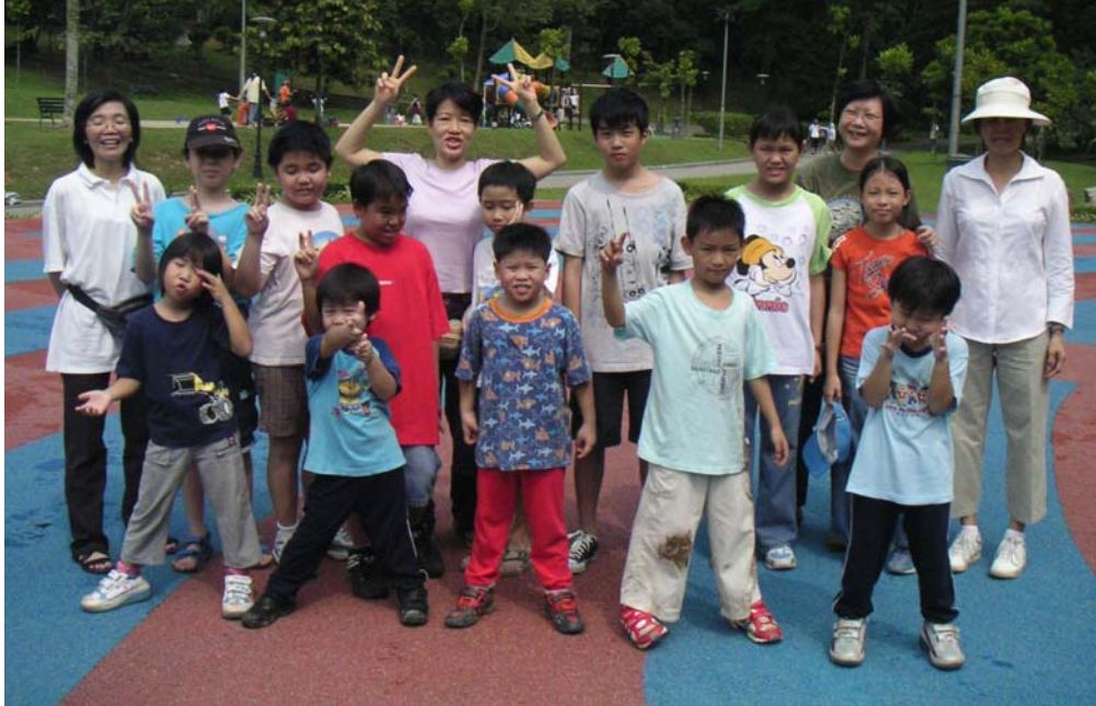
Children's Day outing at the TTDI Park