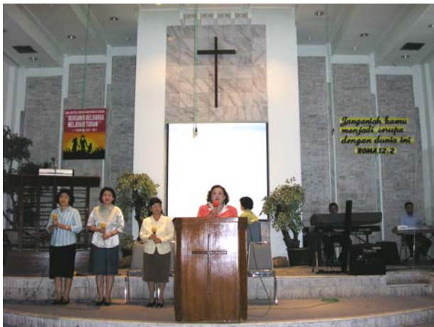
Worship Service at Gereja Sidang Jemaat Allah Batu Tulis, Jakarta