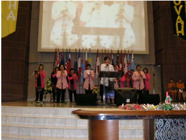
Women's Ministry Christmas Celebration in Gereja Sidang Jemaat Allah Bethlehem, Bogor