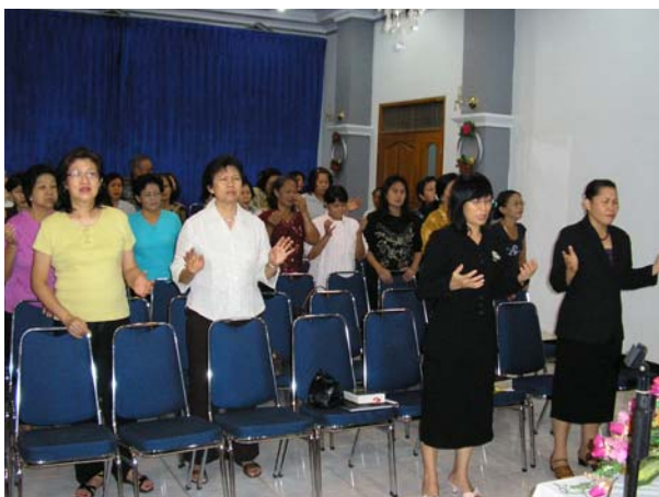
Praise and worship session in Gereja Sidang Jemaat Allah Kemurnian, Jakarta