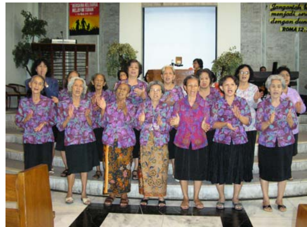
Songs presentation by the Senior Adults of Gereja Sidang Jemaat Allah Batu Tulis, Jakarta