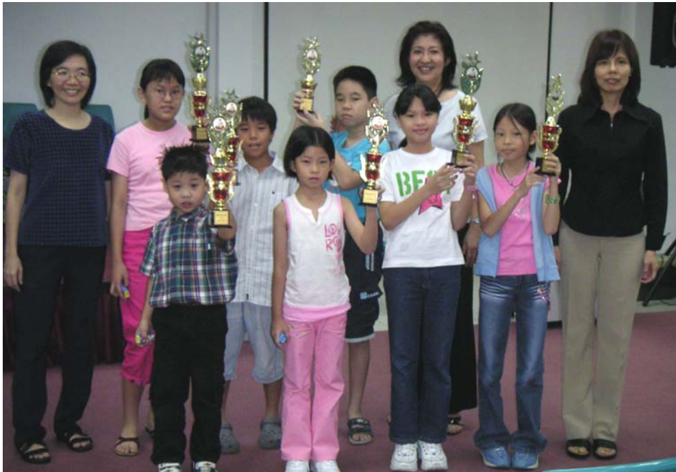
The Winners of the Discovery Hour Bible Quiz 2006