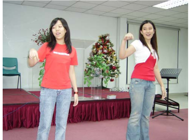
Various presentations by the different cell sectors

What's so glorious about everyday living?