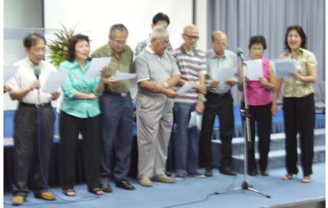
Song presentation by the Senior Adults of Gospel Assembly of God