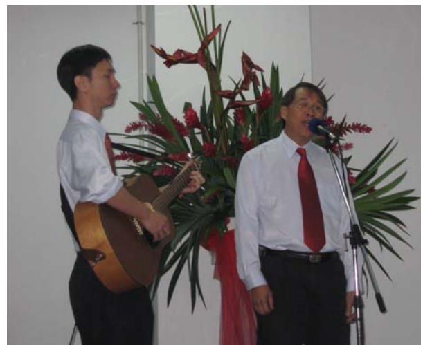
Songs presentation and testimonies by the Hymnsmen on Miracle Sunday